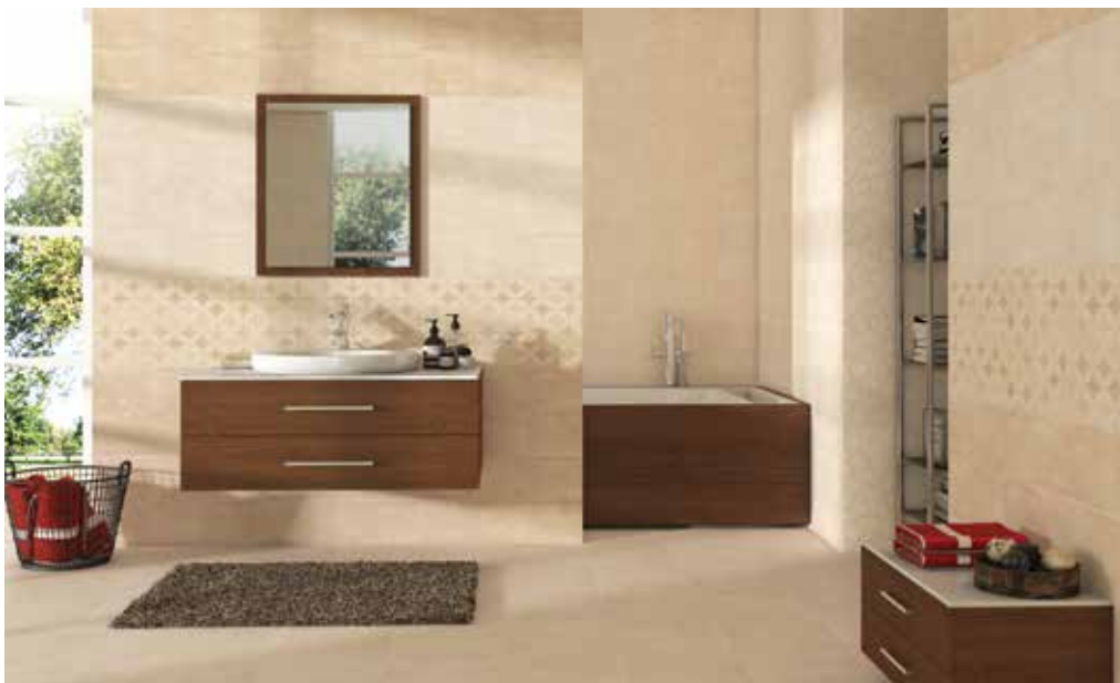
Castle / Matt 20 X 60