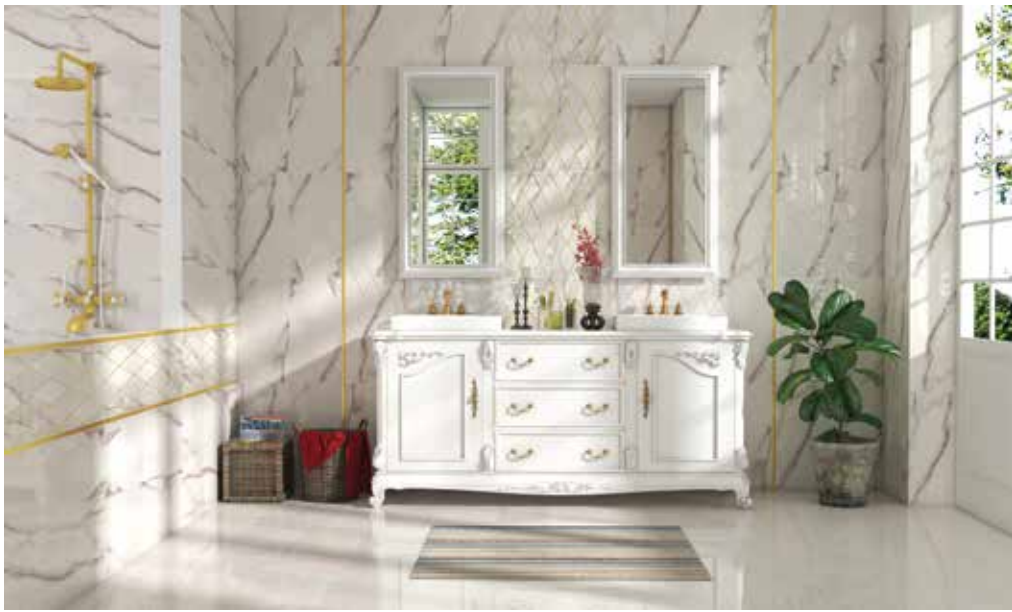
Brillo / Trans 30 X 60